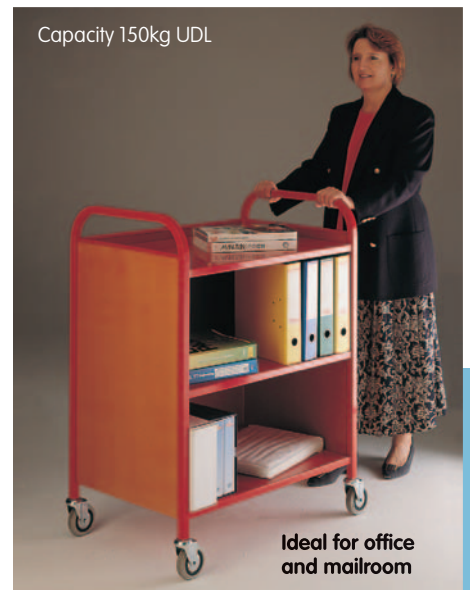
Ideal for office and mailroom

Tubular steel frame with three steel trays. Back and sides infilled with varnished MDF panels. 4 x 100mm swivel castors with grey non-marking tyres and thread guards. Overall L x W x H: 825 x 555 x 1050 mm Shelf L x W: 750 x 500mm Shelf heights: 200; 550; 895mm Total weight: 38kg Red handle Ref: TT20R Green handle Ref: TT20G Yellow handle Ref: TT20Y Blue handle Ref: TT20B