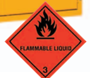
Flammable Cabinets Yellow BS08E51