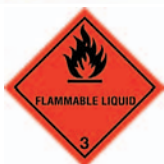
Flammable Cabinet Yellow BS08E51